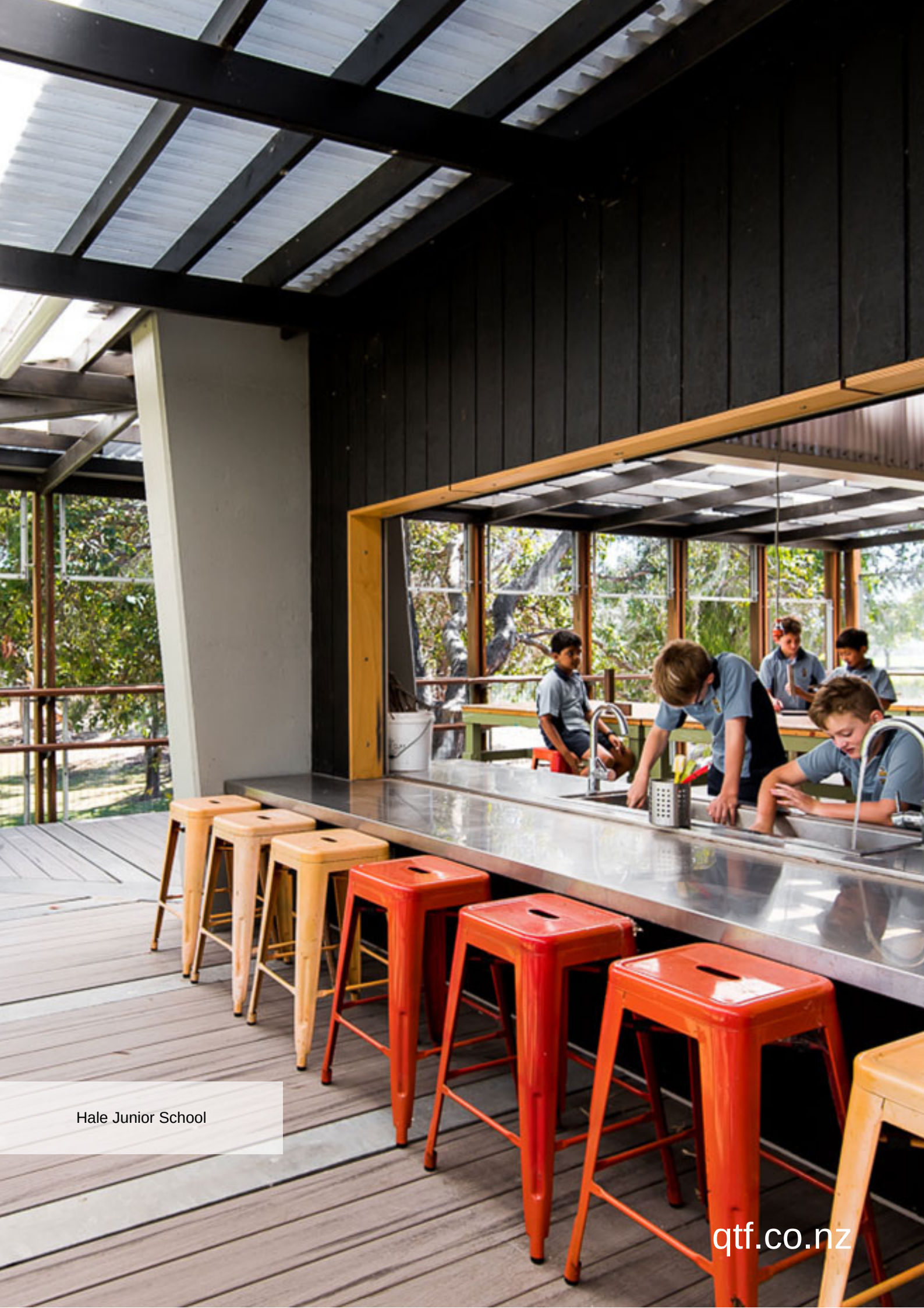
Hale Junior School